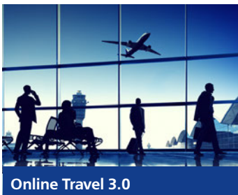
Online Travel 3.0