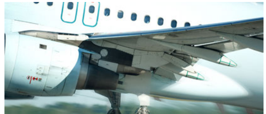
Wings of Russia International Aviation Forum