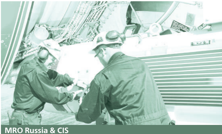
MRO Russia & CIS