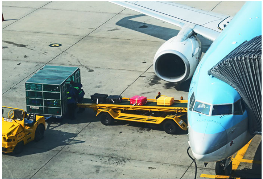
Ground Handling Russia & CIS