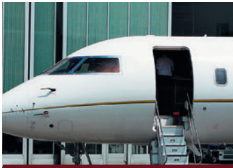
Business Aviation Forum