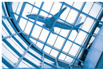
Aircraft Finance and Lease Russia & CIS