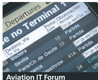
Aviation IT Forum

For more information please contact: +7 495 651-94-35 events@ato.ru www.events.ato.ru